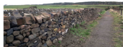
Completed Section of Wall

hour session. We finally finished the stretch of wall just before Christmas.