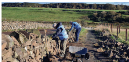
Working on the wall

In early 2019 Craster Parish Council approached Coast Care for help to repair a stretch of dry stone wall that runs from Craster Tower down towards the village. Seizing an opportunity the team at Coast Care organised a short course for twelve volunteers in the construction techniques required for dry stone walling in Northumberland.