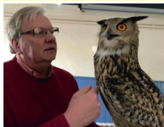
Two Wise Owls Together

Children loved Saffi, the Barn Owl, who is three years old. Saffi