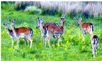
Fallow deer in summer coats at Chillingham Parks.